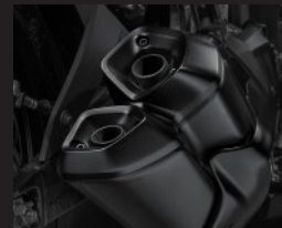
EKZOS BERKEMBAR / TWIN BARREL EXHAUST