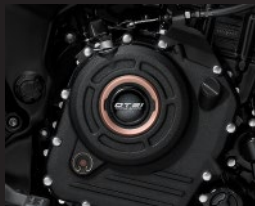
ENJIN SEJUKAN CECAIR 373 CC DOHC / LIQUID COOLED 373 CC DOHC ENGINE