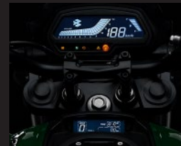
DUA PAPARAN LCD / REVERSE LCD DUAL CONSOLE