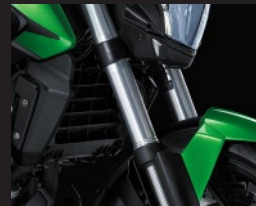
SUSPENSI HADAPAN 'UPSIDE DOWN' / UPSIDE DOWN FRONT FORKS